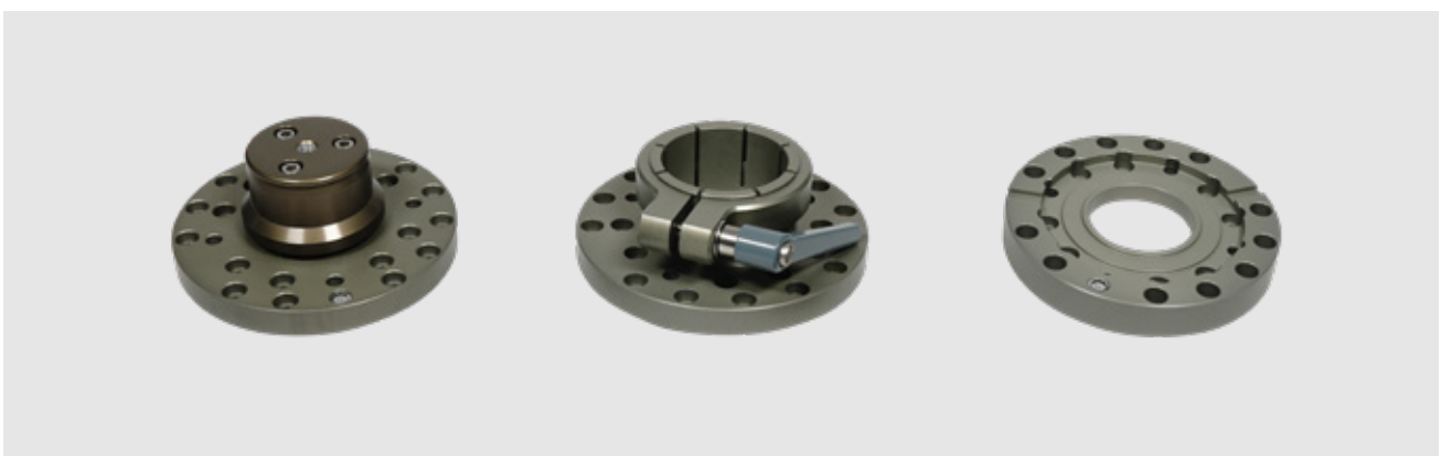
AL-1500 Bazoooka Base Centre Plate (with Euro-adaptor)

The centre plate is available as Mitchell, Euro-adaptor or Euro-clamp (ø 80 mm) accepting Combi-rig tubes, Mitchell and Bowl mounts as well as adjustable and fixed risers. Various sized track or studio dollies can be built by adding Skateboard or Studio Wheels.