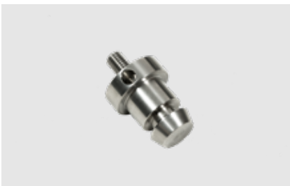
AL-1535 Grip Kit wheel connection bolt