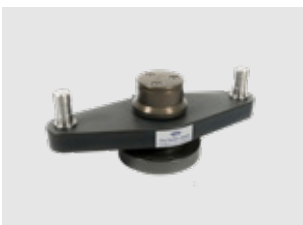
GF-5003 Turnstile mount