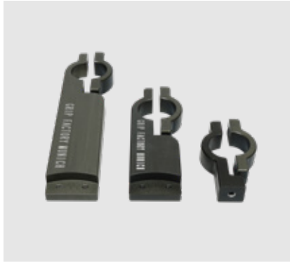
AL-1506 Extension leg for scaffold tube [31 cm / 12"] AL-1505 Extension leg for scaffold tube [21 cm / 8"] AL-1507 Horizontal connector for scaffold tube