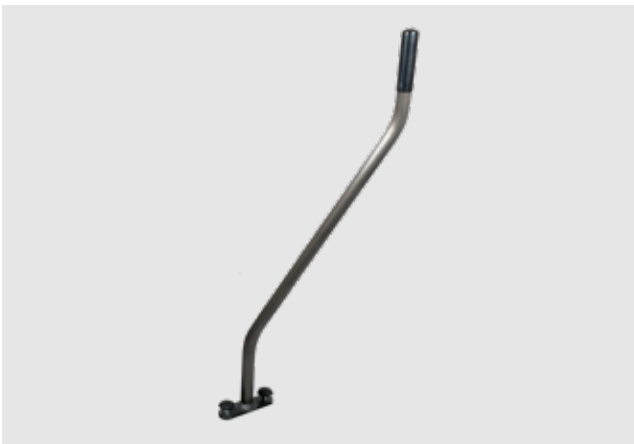
AL-1514 Push bar for Grip Kit Dolly