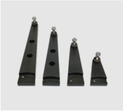
AL-1508 Extension leg [41 cm / 16"] for track operation AL-1503 Extension leg [31 cm / 12"] AL-1502 Extension leg [21 cm / 8"] AL-1501 Extension leg [12 cm / 5"]