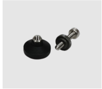
AL-1521 Pad for levelling bolt AL-1504 Levelling bolt for extension leg